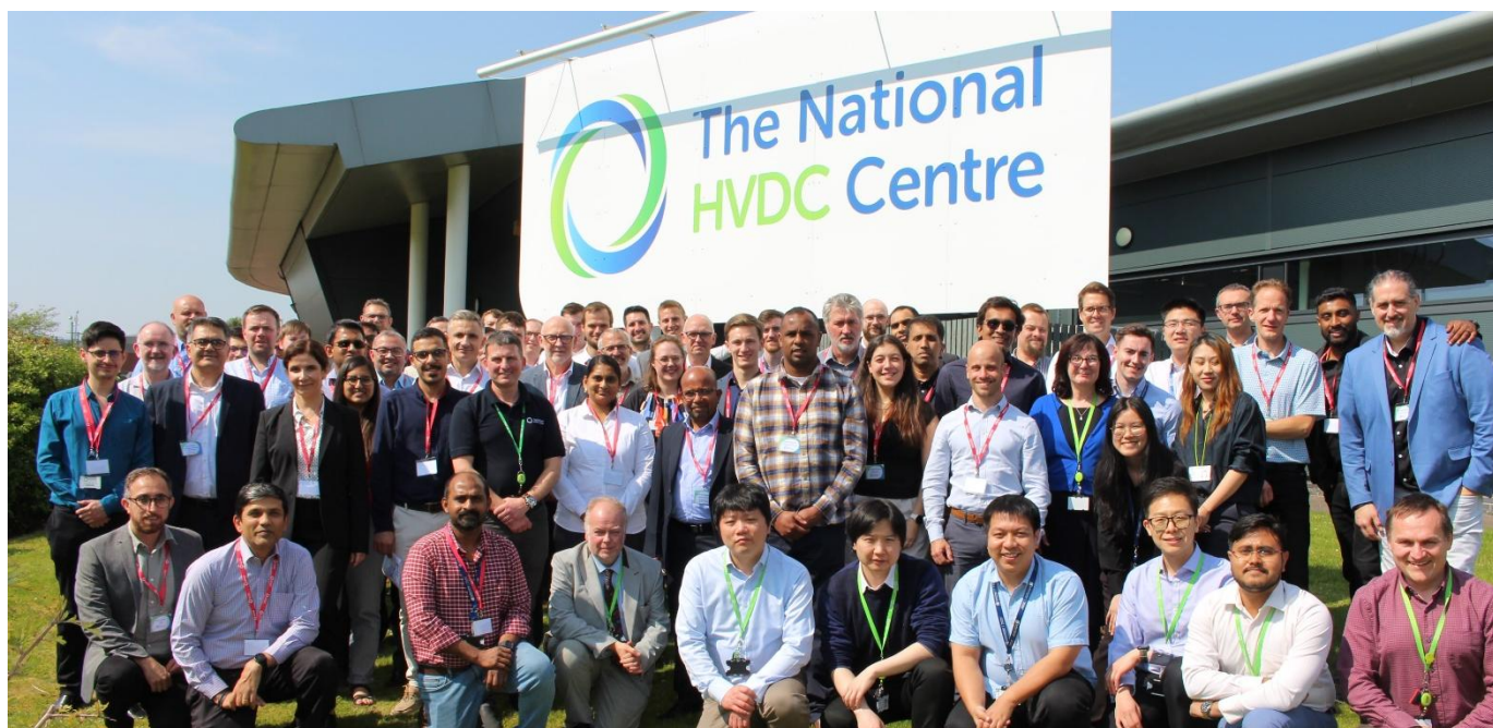
The HVDC Operators' Forum, June 2025

Annual Report (for reporting period April 2025 to March 2026)