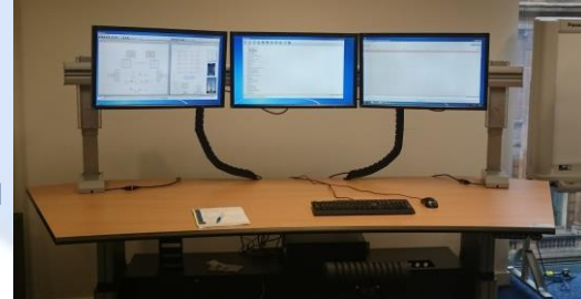
Demonstrator Workstation in our Glasgow Office

The new Centre will focus around Simulation Workstations; a mock-up of one of these workstation has been set-up in our Glasgow office. This enables us to test both the technical integration and also the practical usability of the workstation.