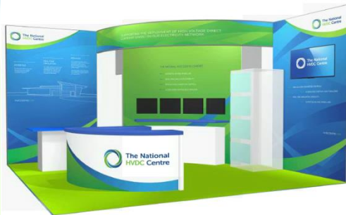
Illustration of our LCNI Conference stand

We will bring this 'Demonstrator Workstation' and our first RTDS ® simulator to the LCNI conference in Liverpool (24 th – 26 th November) where we will demonstrate their capabilities.